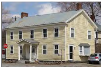
Greek Revival buildings have deeper entabla-

Many architectural styles dot our landscape. The Federal style, is characterized by a shallow entablature under the eave. See this 2-story Ancramdale home below.