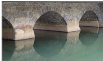
1856 arched stone bridge under Rte 82, Ancram, is the oldest stone bridge in NY State.

The findings of the survey set the stage to apply to the National Historic Registry for designation as a historic town. Benefits are accessibility to grants and income tax credits, without restrictions, for improvements on historically significant properties. More information will be available as the town's application progresses.